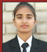
SONAL COURTYARD BY MARRIOTT AGRA