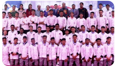
Food Mela in Campus