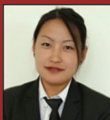
SANGAY LE MERIDIEN - GURUGRAM