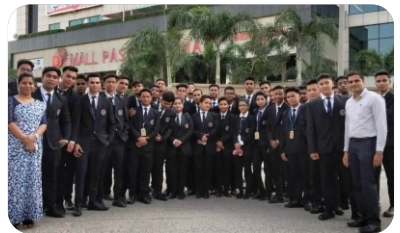
Students During Industrial Visit In ★★★ Star Deluxe Hotel In Delhi