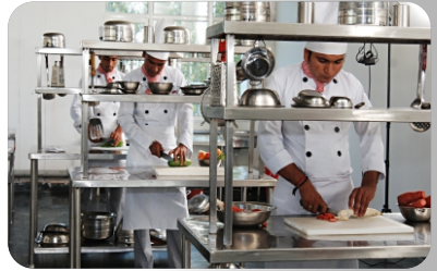
Advanced Training Kitchen

The ATK is where the budding professionals are fine polished to prove their mettle in the industry. Here students are given training in planning and preparation of Indian, Oriental and western cuisines.