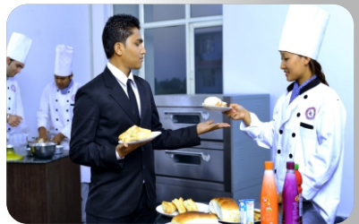
Bakery & Confectionery

The QTK prepares and moulds the students to face the challenges of cooking for large groups and catering the wide variety of people representing different culinary zones of India.