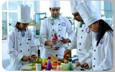
Basic Training Kitchen

The fresher are given an in depth theoretical and practical knowledge. In the BTK the first year students learn the basic culinary art and gear up for further challenges, which they have to face in this field. Continental cuisines are practiced by the students and thus they get to learn international cooking traits and art.