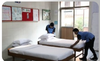
House Keeping Laboratory

The House Keeping Laboratory consists of a guest room with well- designed interiors. The Mock - House Keeping Laboratory and the Laundry equipped with washing machines, dryer, and a wash area enable students to get the right feel of the department.