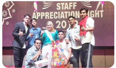
Lchm Students During Industrial Training in Malaysia