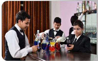
Restaurant & Mock Bar

The Bakery & Confectionery department trains the student in the art of making various types of breads, confectioneries like pudding, cakes, ice creams etc. to make them adept in this field.