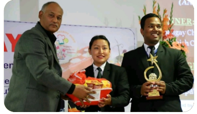
"LCHM Students Winners at National Level Competition"

English as one Subject & 45 % Marks in aggregate (40% for SC/ST)